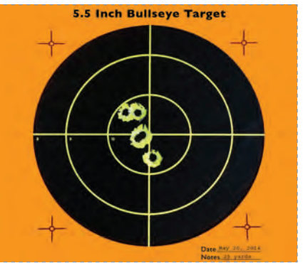
The VP Series pistol possesses HK's well-earned reputation for handgun accuracy (HK staff test target, 5 shots with a VP9 at 25 yards).