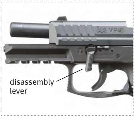
Simple and easy disassembly with the new HK takedown lever. For optimal safe handling, VP pistols cannot be disassembled with a magazine in the magazine well—and the trigger doesn't need to be pulled to remove the slide.