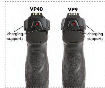
Nearly identical, the VP40 has a taller (by 1 mm) and slightly heavier slide than the VP9. Patented HK Charging Supports help facilitate smoother and easier manipulation of the slide during clearing or reloading. The rear of the striker is colored red and serves as a cocking indicator.