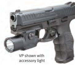
VP shown with accessory light