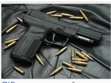
FN Five-sevens were among the weapons allowed to walk.<sup>[41]</sup>

Justice Department task force. [3] However, long-standing DOJ and ATF policy has required suspected illegal arms shipments to be intercepted. [4][5]