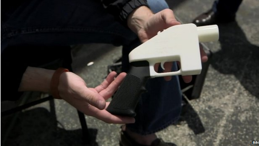
The world's first 3D-printed gun

A 27-year-old man from near Tokyo has been arrested for allegedly possessing guns made with a 3D printer, according to the Japan Broadcasting Corporation.