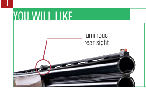
2 «Internal» chokes: Cylinder and 1/2 choke